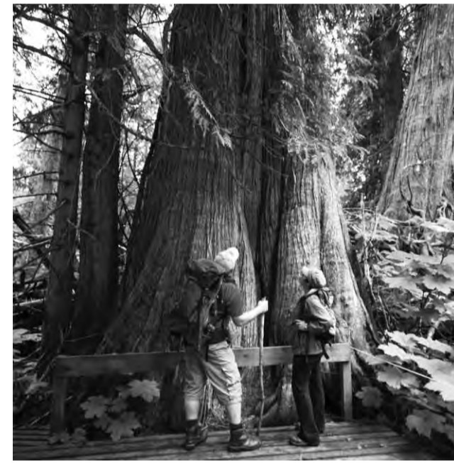
Hiking in the Ancient Forest.

For those wanting to get out into nature, try fishing some of the area's famous streams, rivers and lakes for rainbow and lake trout, Arctic char and Dolly Varden. A hike in the Ancient Forest, an hour's drive east of Prince George, is also a must. It's an extremely rare inland rainforest with the huge cedar trees you could expect to see along the Pacific Coast, not a thousand kilometres inland. Some trees are more than 10-feet in diameter!